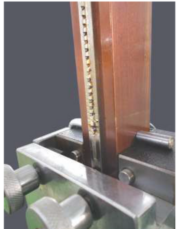
Close view of Broach