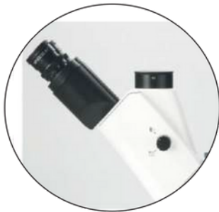
Light Distribution (both): 100:0(100% For Eyepiece); 80:20 (80% For Trinocular Head And 20% For Eyepiece)