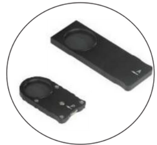
Analyzer & Polarizer for Simple Polarizing Observation