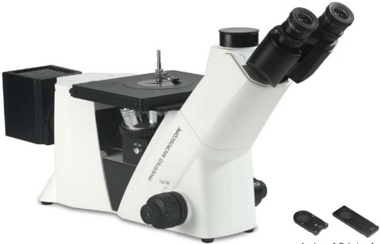
Analyzer & Polarizer for simple polarizing observation

Objective specification: ( "●" Is Standard outfits, "○" Is Optional Accessories.)