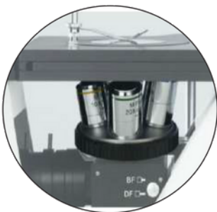
Dark Field Objective, Make Observation In Dark & Bright Field