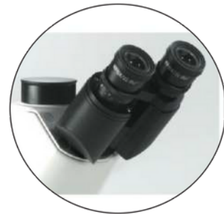
Oversize View Field Eyepiece, View Field Up To 22mm For Comfortable Observation