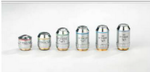
Metallurgical LWD Infinity Plan Objectives