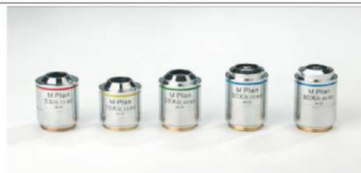
Metallurgical LWD Infinity Plan Objectives for Bright & Dark Field